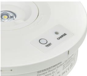
EM152C Emergency recessed Downlight details