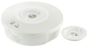
EM152C Emergency Recessed Downlight family